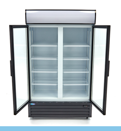
Equipped with 8 adjustable stainless steel grids