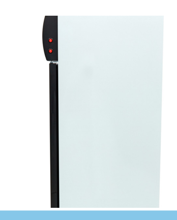
Easy to operate