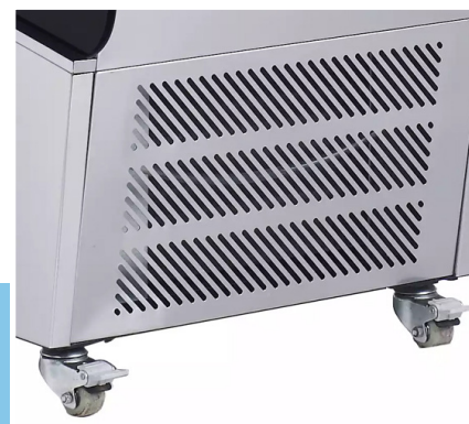
Cooling system with fan and automatic defrosting