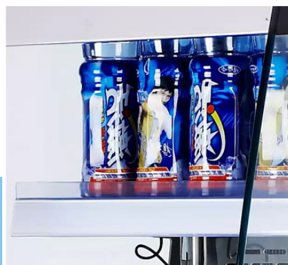
Three coated shelves with cardholders