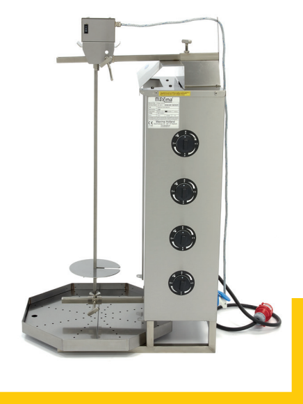
With adjustable skewer for perfect preparation.