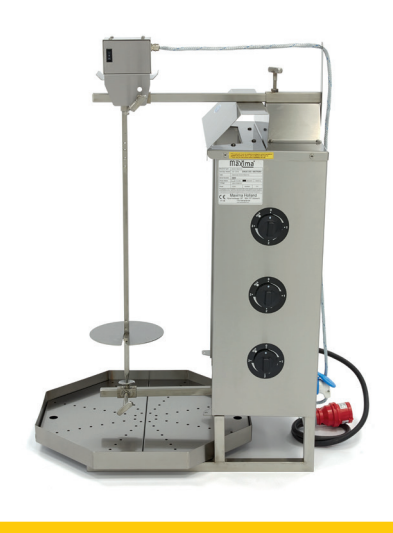
With adjustable skewer for perfect preparation.