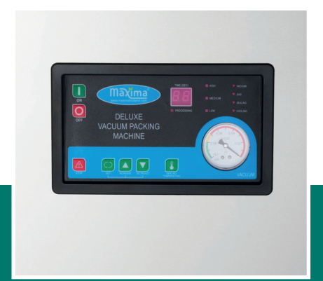
Digital control panel, fully adjustable

Adjustable vacuum time, adjustable sealing time, adjustable sealing temperature and adjustable cooling time