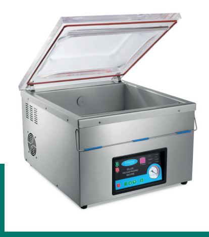
Standard with service pack