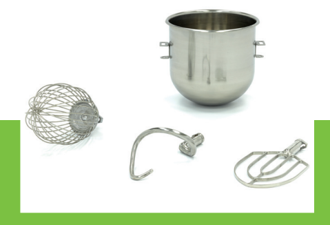
Robust stainless steel bowl and accessories