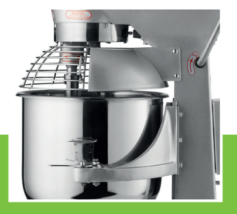
Stainless steel protective guard over the bowl